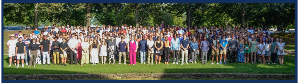
Incoming students from the 2023-2024 academic year gather outside of the Paul Porter Center for the Performing Arts after the Convocation Ceremony.