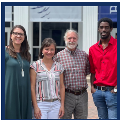
The First-Year Advising Team

This summer, renovations began inside Coltrane Hall to create the new home for our First-Year Advising Program. The renovations are on going at the time of print for this publication. The project is expected to be completed by the first week of September.