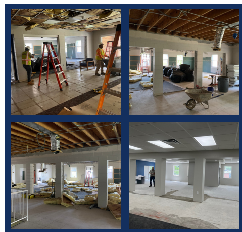
Student Success Center renovation in Coltrane Hall