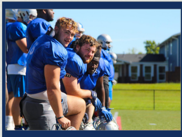
Preseason includes learning the foundation of the BC Football Program, as well as the importance of living and learning in your community.

"As with any occupational choice, progress in your field should be a continuing goal. Remaining static is not an option. Being on staff with the USFL offers an excellent opportunity at a professional level for such advancement. Exposure to variable approaches, innovative ideas, and comparative analysis on a first-hand basis is always superior to attending seminars or watching slideshows. Bringing home to Brevard the benefits of this experience will provide an invaluable asset to our coaches, our players, and the Tornado football program in general."